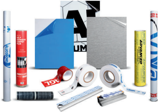
Films for all surfaces!